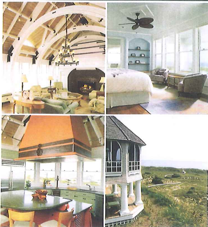
WHALE'S TALE: The 4,500-square-foot home occupies two adjacent lots.

"It's got the best views of the entire island," Anna says. dietschedietsche.com .