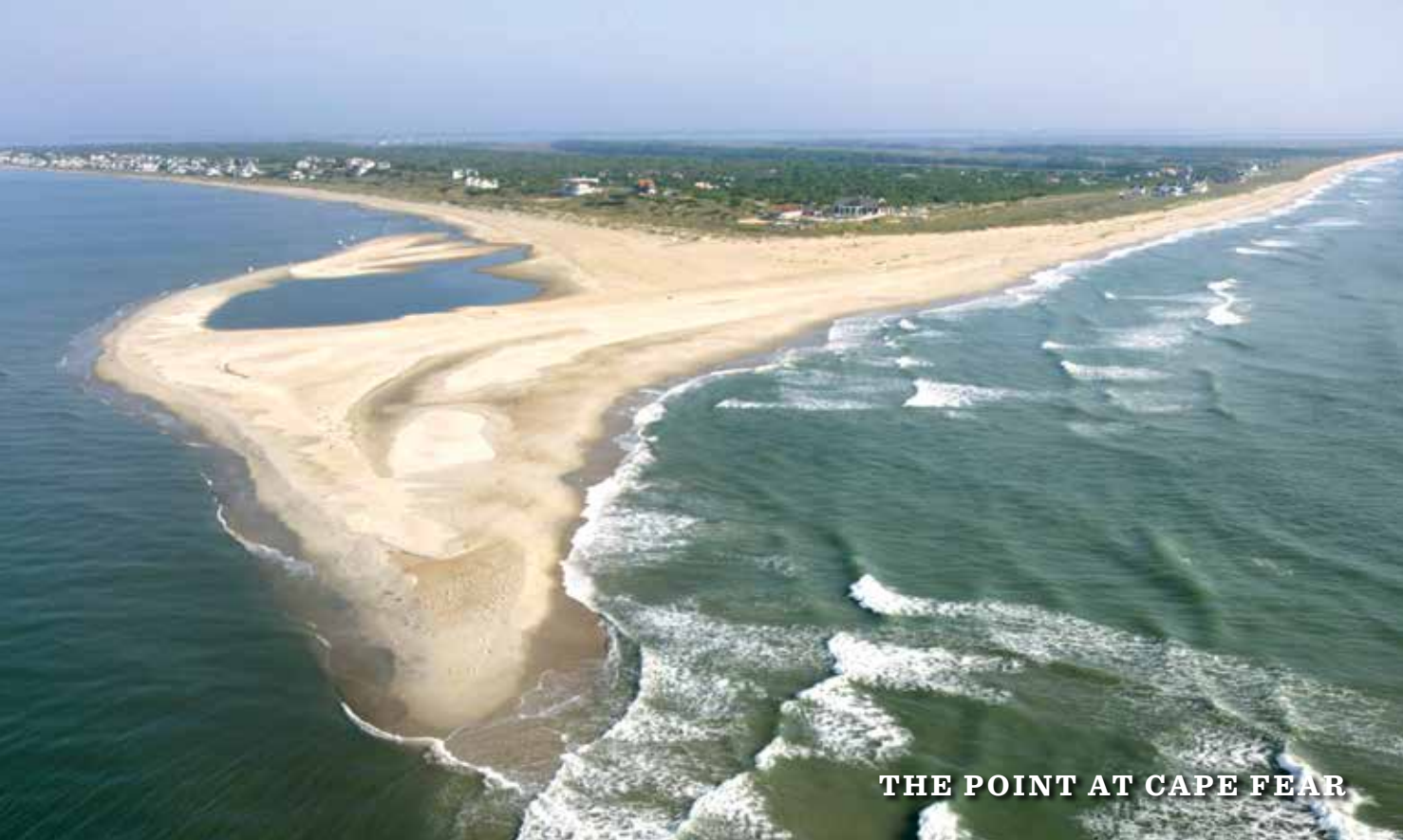
THE POINT AT CAPE FEAR