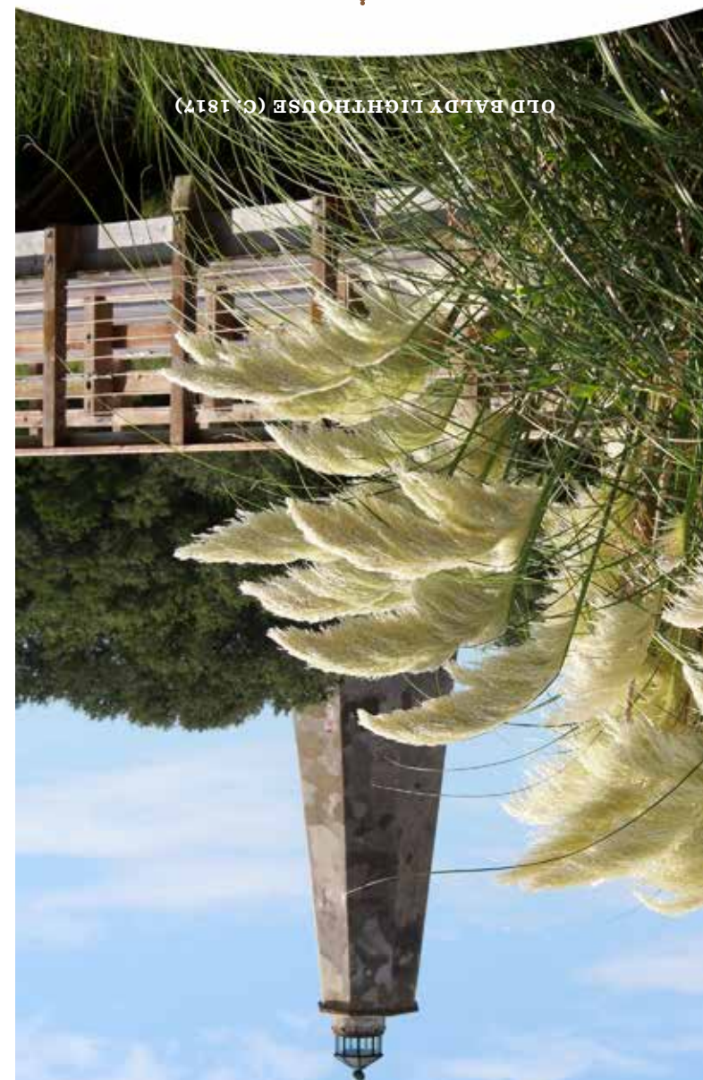
OLD BALDY LIGHTHOUSE (CA. 1817)

Environmentally oriented gifts, books, jewelry, chocolates, toys and apparel. Proceeds benefit the Bald Head Island Conservancy. www.bhic.org . 910-457-0917.