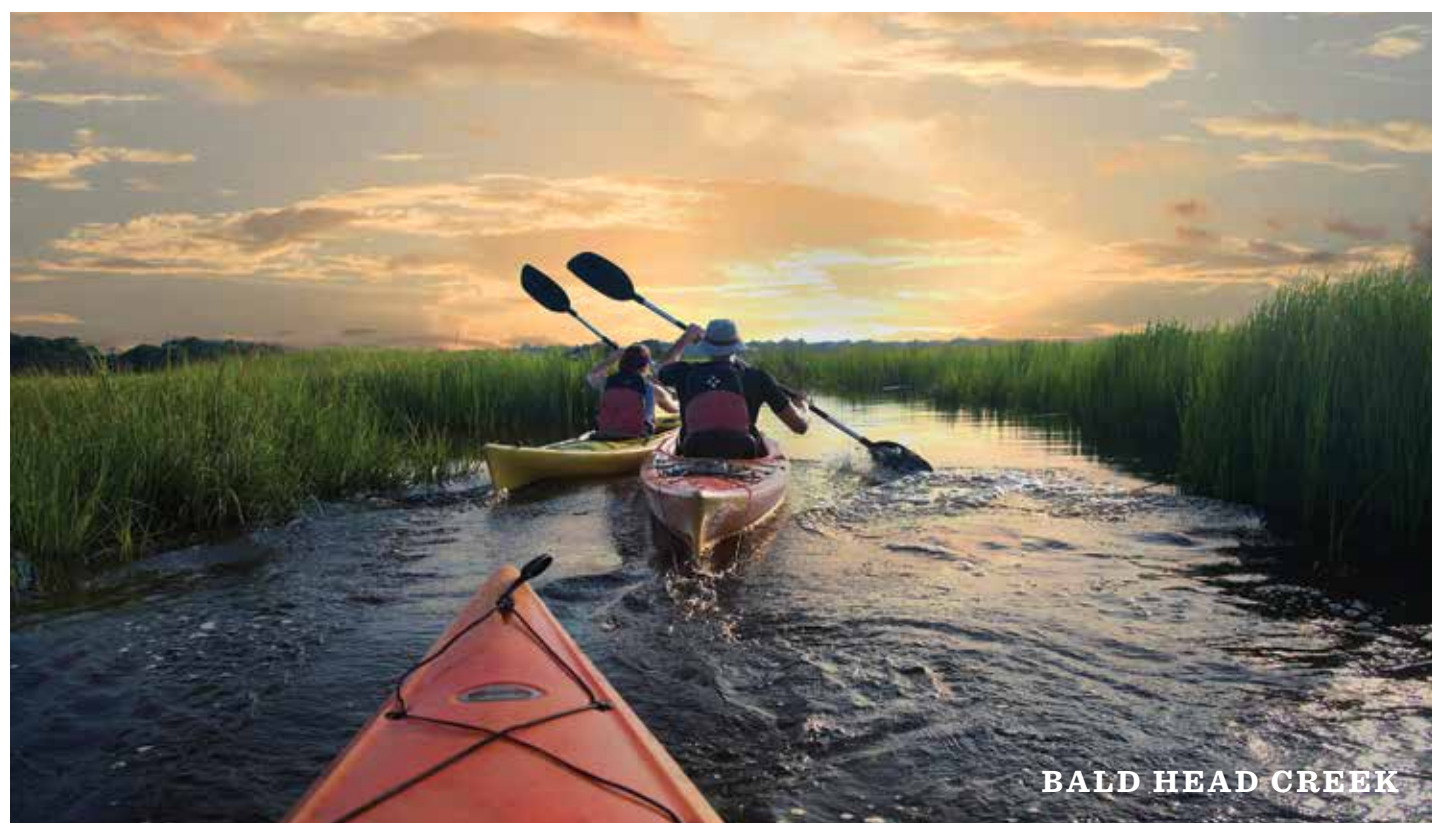
BALD HEAD CREEK

Full-service spa and salon offering massage, skincare, manicures, pedicures, haircuts and coloring, as well as botox, fillers and a complete line of skin, nail and hair products. www.islandretreatspa.com . 910-454-0333.