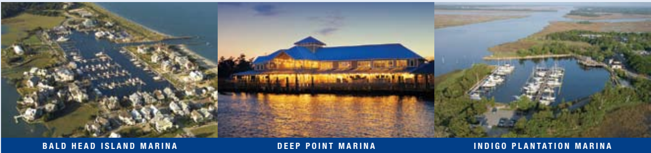
BALD HEAD ISLAND MARINA